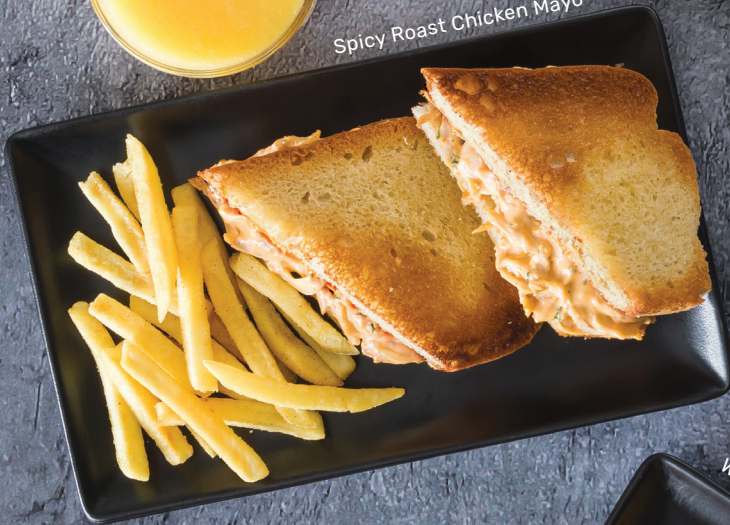
Spicy Roast Chicken Mayo