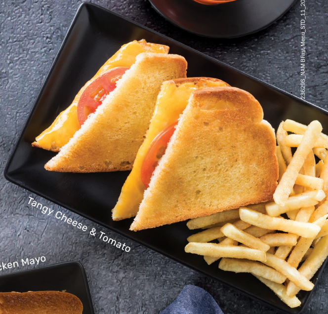
Tangy Cheese & Tomato