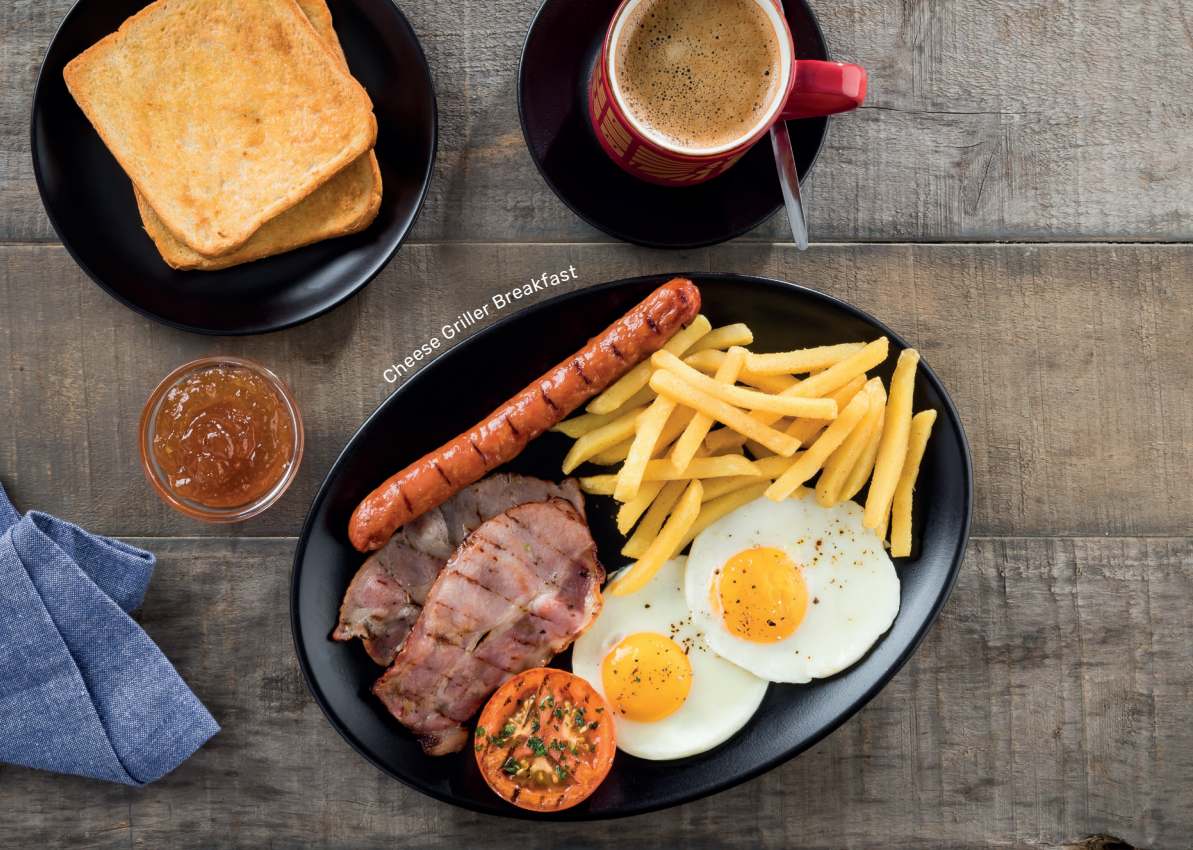
Cheese Griller Breakfast