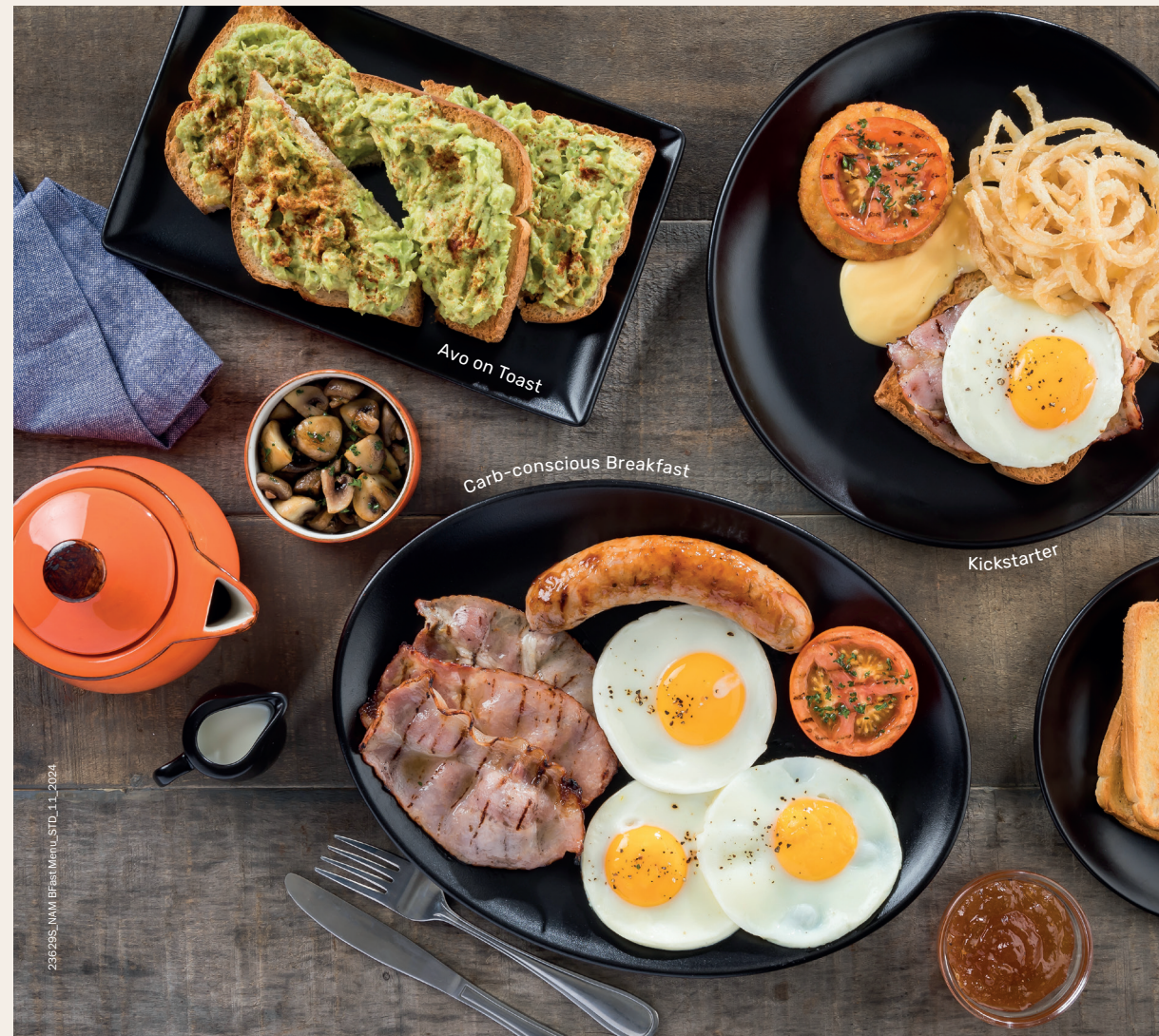
Avo on Toast